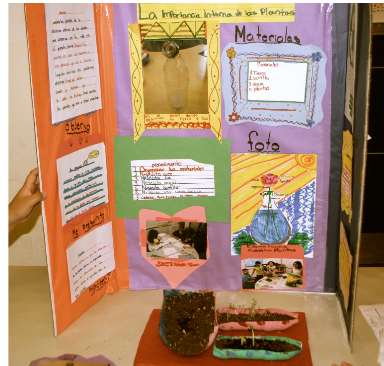
Student science project on plant growth

Action oriented activities on the following topics: air quality, energy, population, and wildlife